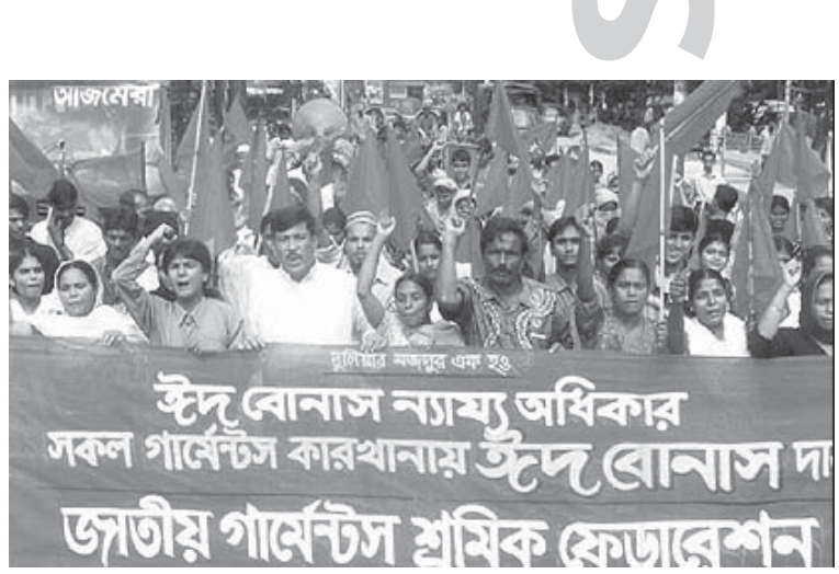
NGWF stages half-day general strike.

labour leader that took place shortly after negotiations with management and local officials broke down. Workers were also demanding payment of outstanding wages and their Eid Festival bonus. (Eid is an important Muslim holiday, marking the end of the month of Ramadan.)