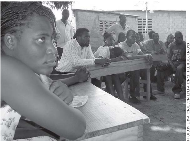
Above: Haitian workers attend a SOCOWA union meeting

For a copy of the report, visit: www.maquilasolidarity.org.