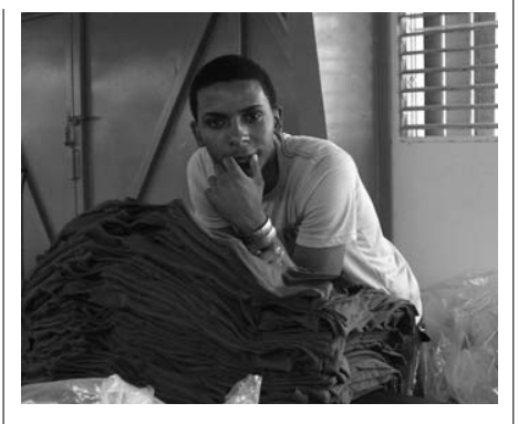
ABOVE: Workers at the AltaGracia factory: decent work and a living wage

The factory, located in the Dominican Republic's Villa Altagracia Free Trade Zone, employs 130 workers producing tshirts and hooded sweatshirts and is fully owned by Knights Apparel. At the suggestion of the Worker Rights Consortium (WRC), the company is using the same facility where workers lost their jobs five years ago, when a Nike