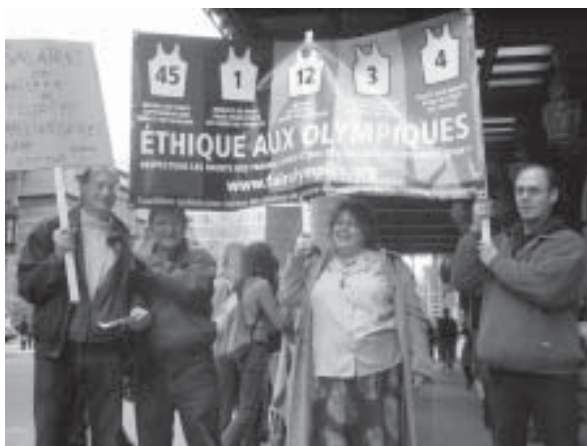
"Play Fair at the Olympics" campaigners rally outside COC congress, Montreal, April 17

The Canadian coalition is also calling on Roots Canada, a major supplier of Olympic uniforms, to adopt a code of conduct based on International Labour Organization (ILO) standards and an