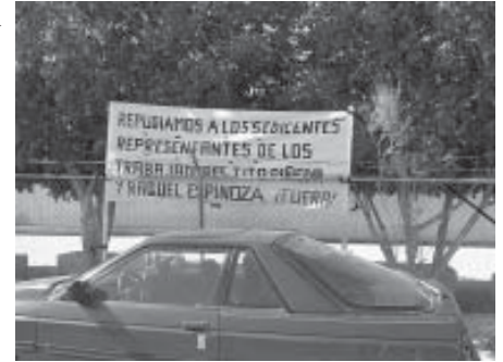
Independent union banner at Pung Kook

Conciliation and Arbitration Board on a petition from the workers' independent union, SINTTIM.