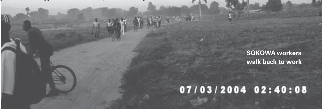
SOKOWA workers walk back to work