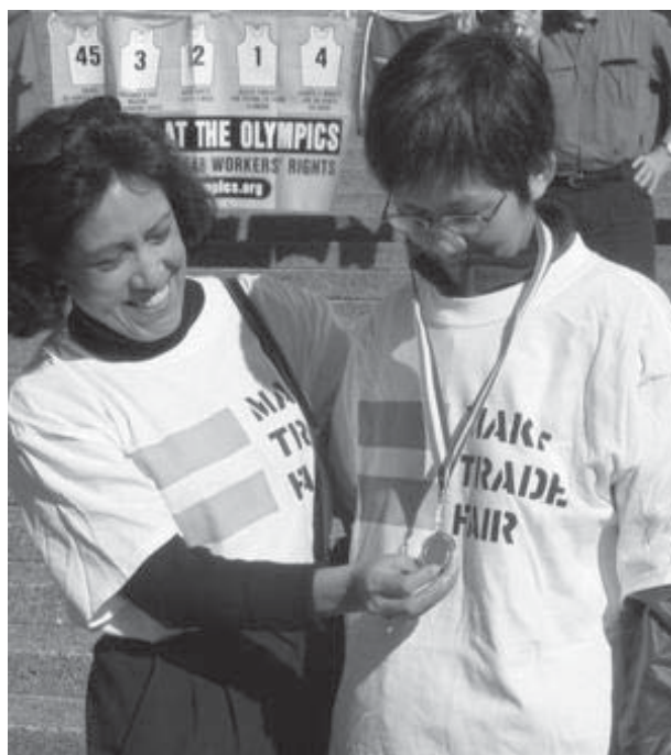
Local garment worker receives a gold medal at the Vancouver "Play Fair at the Olympics" campaign launch

The day before the COC congress, Canadian Olympian Bruce Kidd expressed his support for the campaign in an opinion piece in The Globe and Mail , noting that his colleagues